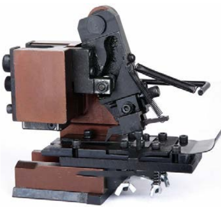
OTP Positive Vertical Mold