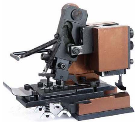
OTP Reversed Vertical Mold